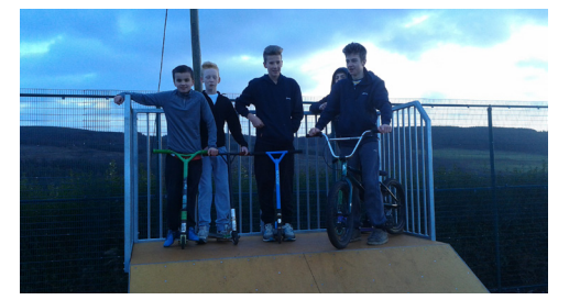
Above: Bryn youth making use of the facilities. See the village website for more photos and information.

We are up and open for entertainment. There is still further work to be completed over the coming months, mainly on the tennis court, but most facilities are now in use.