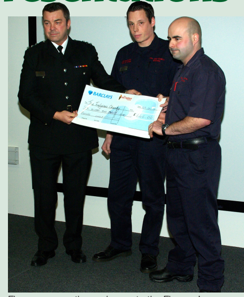
Firemen presenting a cheque to the Fireman's Benevolent Fund for \mathfrak{L}600 . These firemen ran the 10K in full outfits carrying a BA Cylinder on their back!