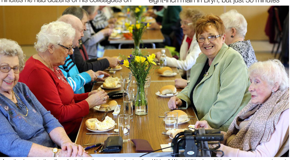
As a thank you to the village for their patience and understanding, Wales & West Utilities bought ten flower arrangements and vases for that week's over 50 club lunch, but the biggest reward was being able to turn the heating back on in our homes.

It took 16 hours to find the fracture on the eight-inch main in Bryn, but just 30 minutes